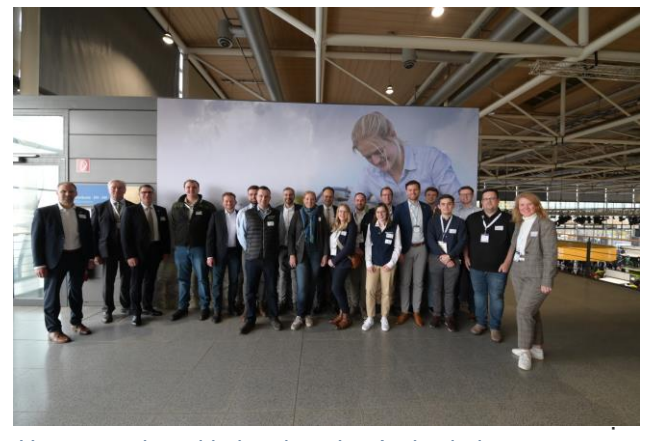
Happy reunion with the alumni at Agritechnica.

The Claas-Foundation invited former award awardees and scholarship winners to a meeting in November. The CLAAS booth at Agritechnica in Hanover provided the perfect setting.