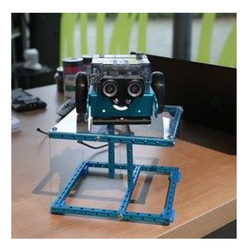
When fully assembled, the mBot2 puts on a friendly face.

The training serves as preparation for the further introduction of mBots into the school curriculum, whether in technology or computer science lessons, or in the afternoon project groups. The mBot promotes project-oriented learning, which is becoming increasingly important in schools. A competition in the summer rounds off the initiative.